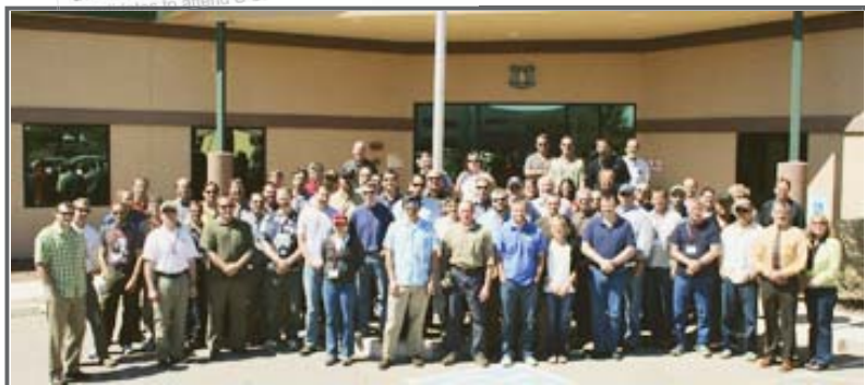
S-590 - Class of 2010