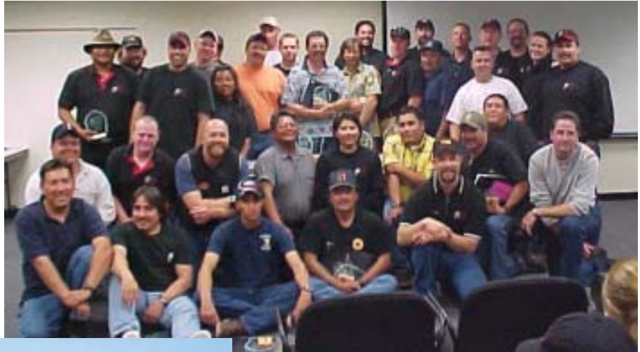
Graduates of the spring 2002 session.

During the spring 2002 session, students worked with multiple land management agencies, including the Forest Service, Bureau of Land Management, Fish and Wildlife Service, and National Park Service (NPS). Students worked on a variety of fuels management projects, including prescribed burning, burn plan writing, and fuels inventories. Students successfully participated in treating 21,571 acres with prescribed fire (Table 1).