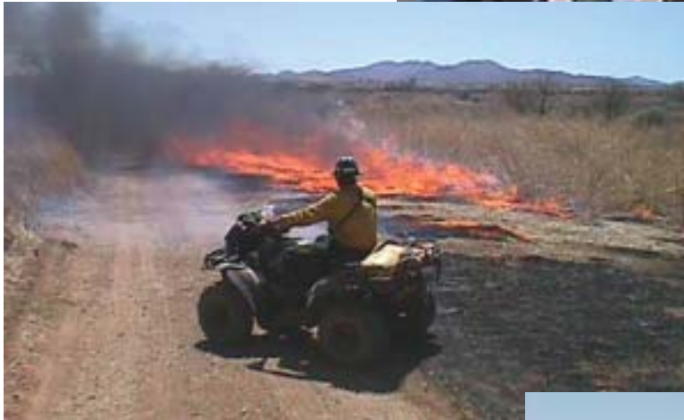
A prescribed fire on Buenos Aires National Wildlife Refuge in southern Arizona used by the students as part of their training.

Two additional NWCG courses were coordinated and offered outside the 8-week academy: RX-310, Introduction to Fire Effects and S-390, Introduction to Wildland Fire Behavior Calculations (Table 3). These two courses complement the spring curriculum, and S-390 is an academy prerequisite.