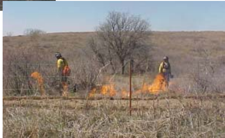
Prescribed burning in Texas.

Table 2 is a summary of training accomplishments during the spring 2002 session. Successful completion of all NWCG courses is required for academy graduation. Four NWCG courses were offered during the spring session. A total of 123 trainees successfully completed these courses, resulting in 4,216 person hours of training.