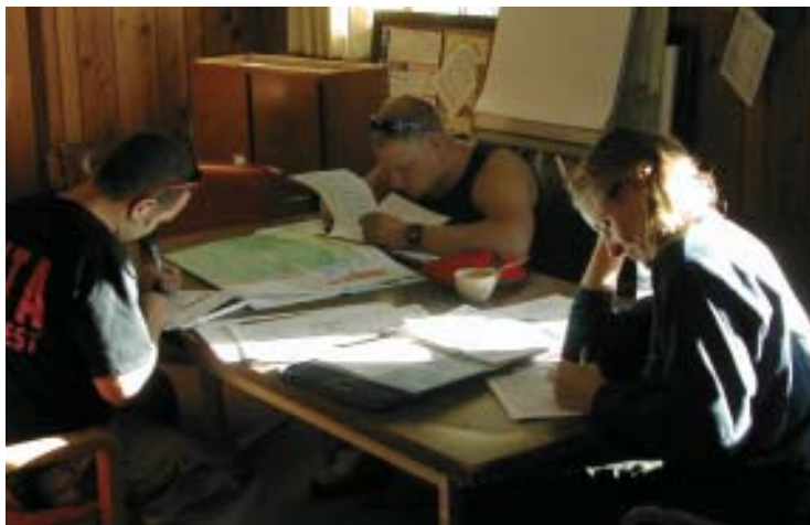
Preparing for Lochsa Prescribed Burn, Clearwater National Forest, Idaho.

acres with prescribed fire. Table 5 lists the fuels management projects in which FUTA trainees participated during the fall session.