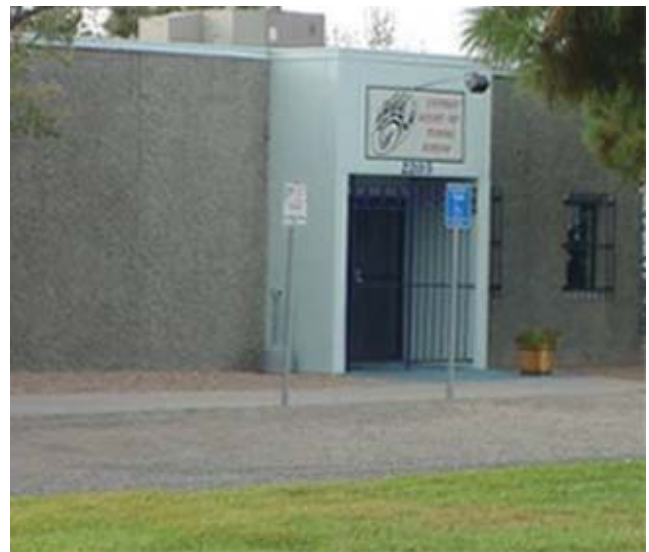
The FUTA office at 2203 Columbia, SE, in Albuquerque.

The academy successfully graduated its eighth and ninth classes in 2002. Following, by session and cumulatively, is a summary of events that occurred during the year.