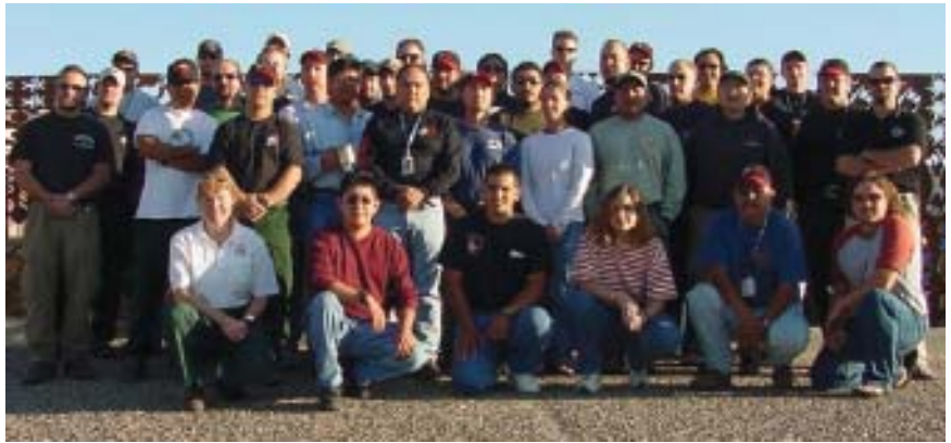
Graduates of the fall 2002 session.

During the fall session, students worked with multiple land management agencies on projects including prescribed burning, burn plan writing, and fuels inventories. Students successfully treated 13,492