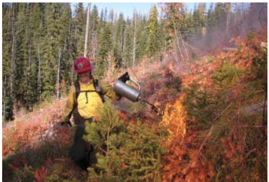
Lochsa Prescribed Burn, Clearwater National Forest, Idaho.

During the fall session, four workshops were available to students (Table 8). Santa Fe National Forest employees hosted and coordinated the Aerial Ignition Workshop. The Forest Service Regional Office coordinated and offered Fireline Leadership several times during the session and eight FUTA students attended.